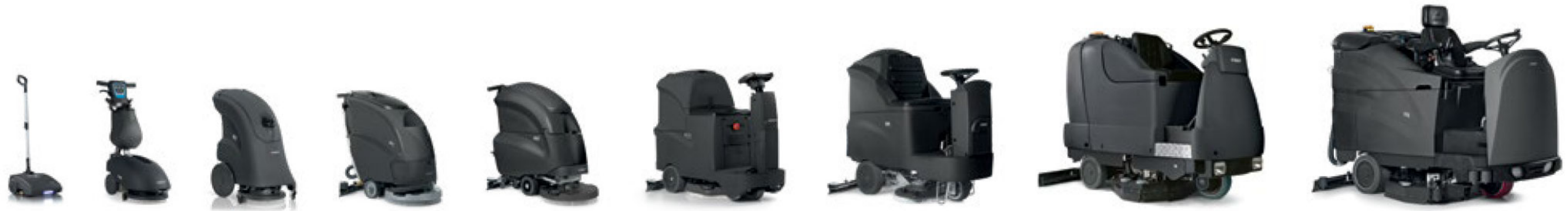
FIMOP Genie My16 My50 MMx Mxr Mr Magna SMg