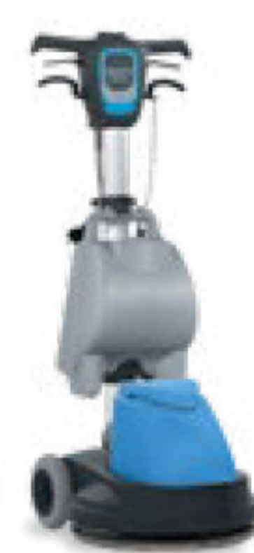
FM43 TP Orbital