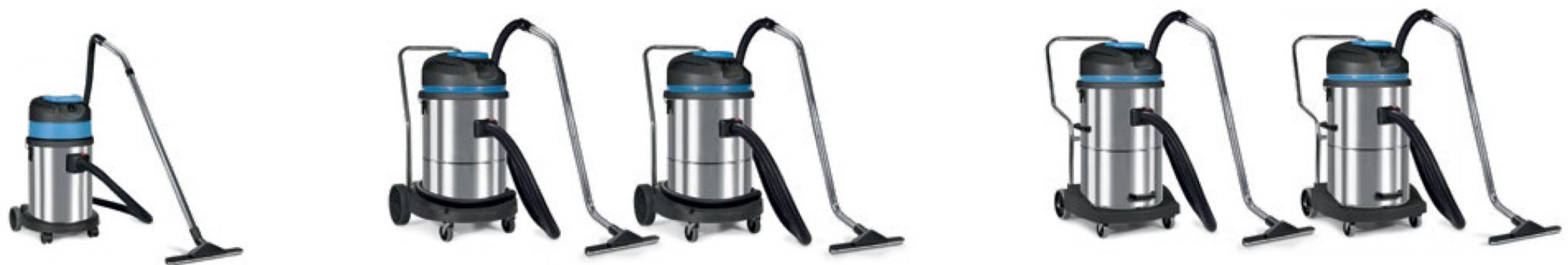
FV A30.1 WD