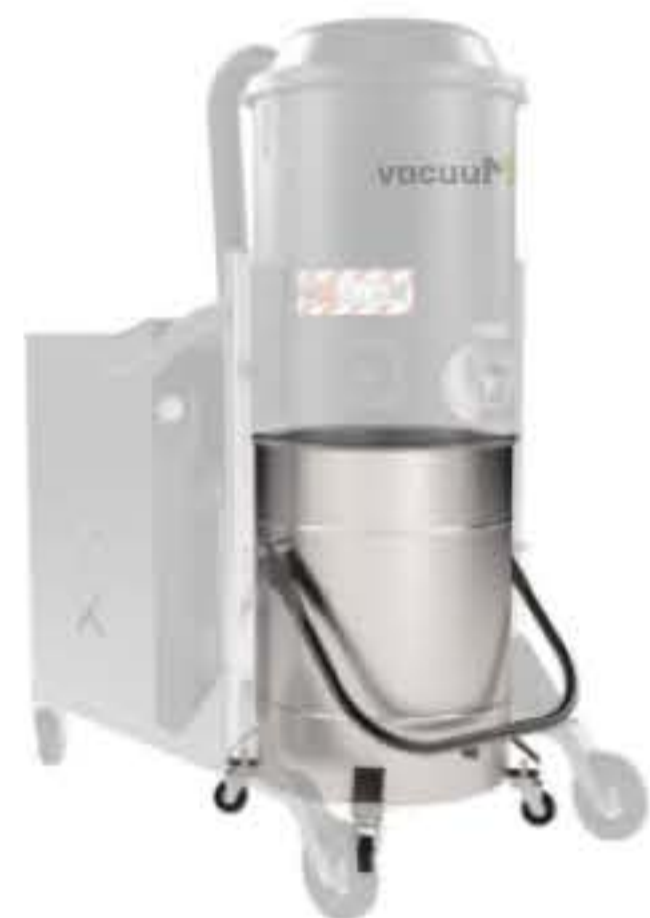
BX Stainless steel bin AISI 304