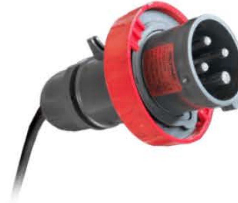
4-PIN ATEX INDUSTRIAL PLUG