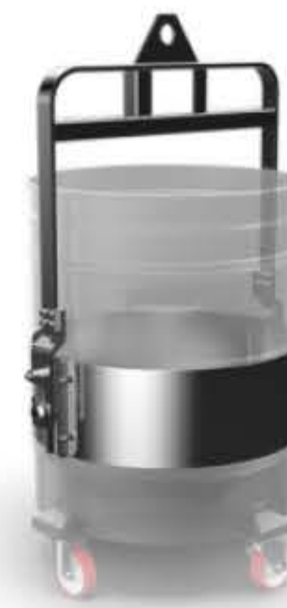
CONTAINER EMPTYING KIT System for easy container emptying using forklift lifting.