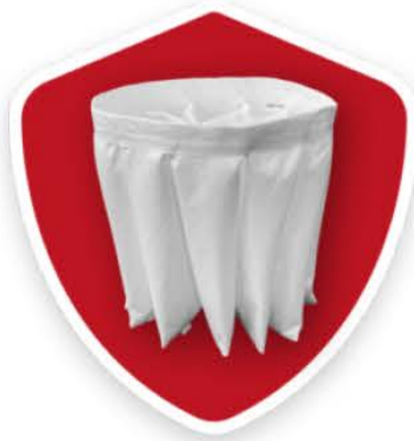
3 YEARS WARRANTY Purchasing the replacement filter along with the vacuum