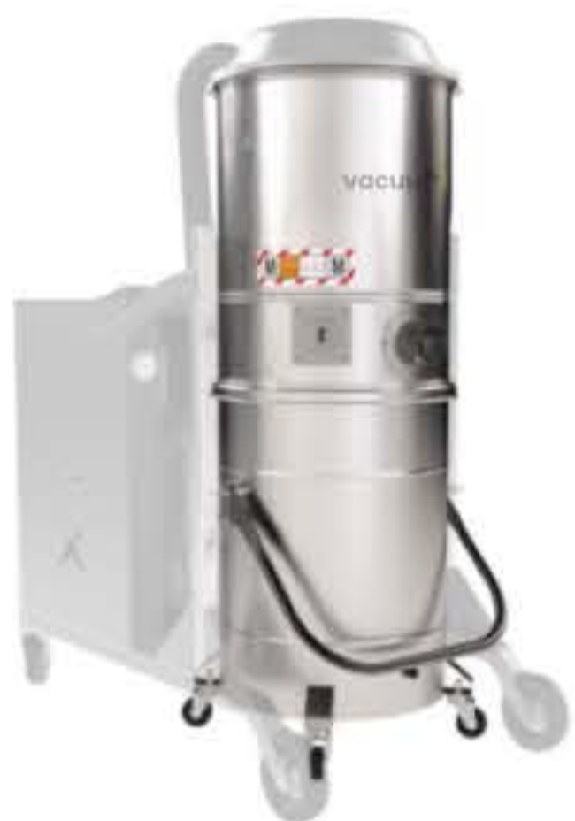
GX Stainless steel bin and chamber AISI 304