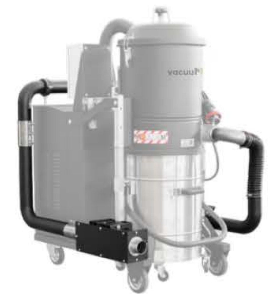
SPARK TRAP Built to capture sparks produced during welding, sanding, or polishing operations on metal parts