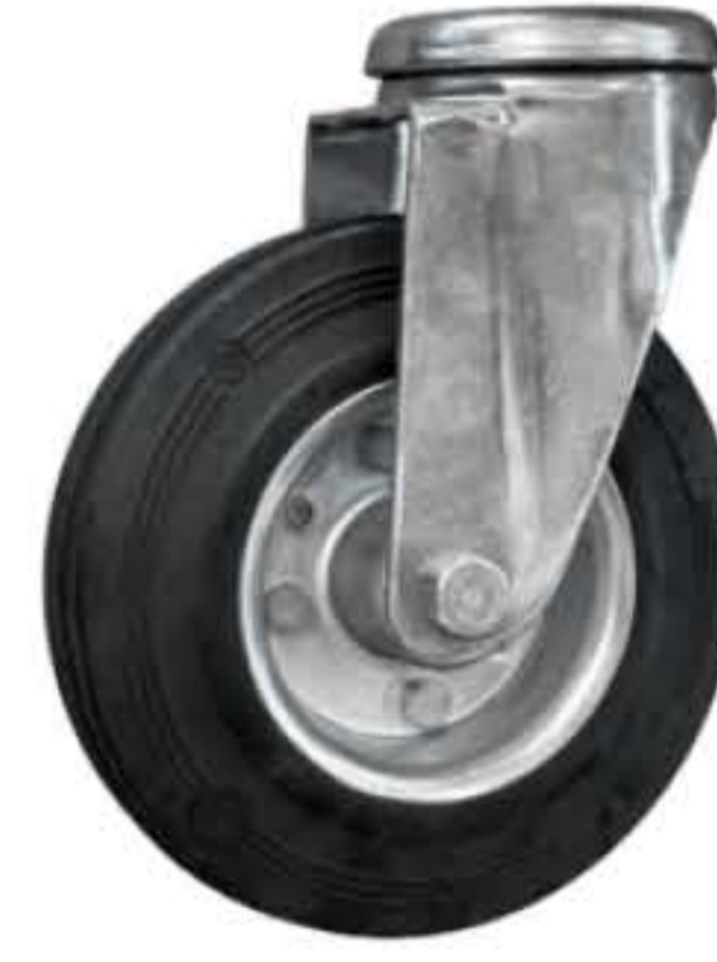
WHEELS Non-marking pivoting wheels