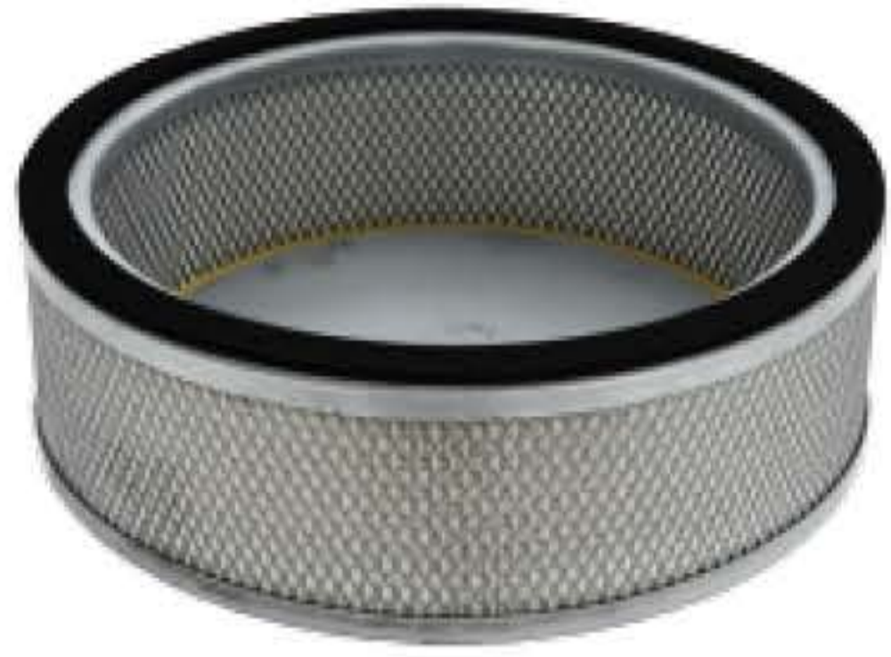
HEPA 14 Absolute filter (EN 1822) 28.000 cm 2 filter surface H14 Class Filter (EN 1822) Glass fiber