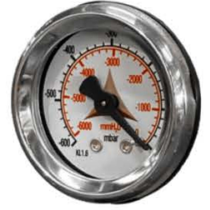
VACUUM GAUGE Vacuum gauge for indication of filter clogged or in need of replacement