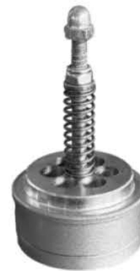
PRV Pressure relief valve installed