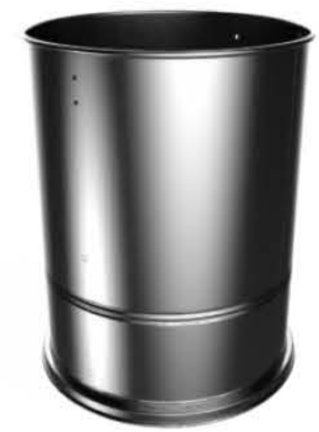
STEEL CONSTRUCTION Rugged industrial coated steel construction