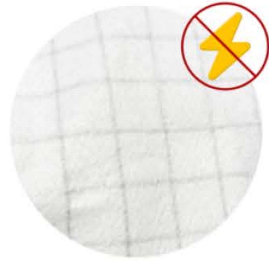
ANTISTATIC FILTRATION Antistatic filtration to discharge static energy