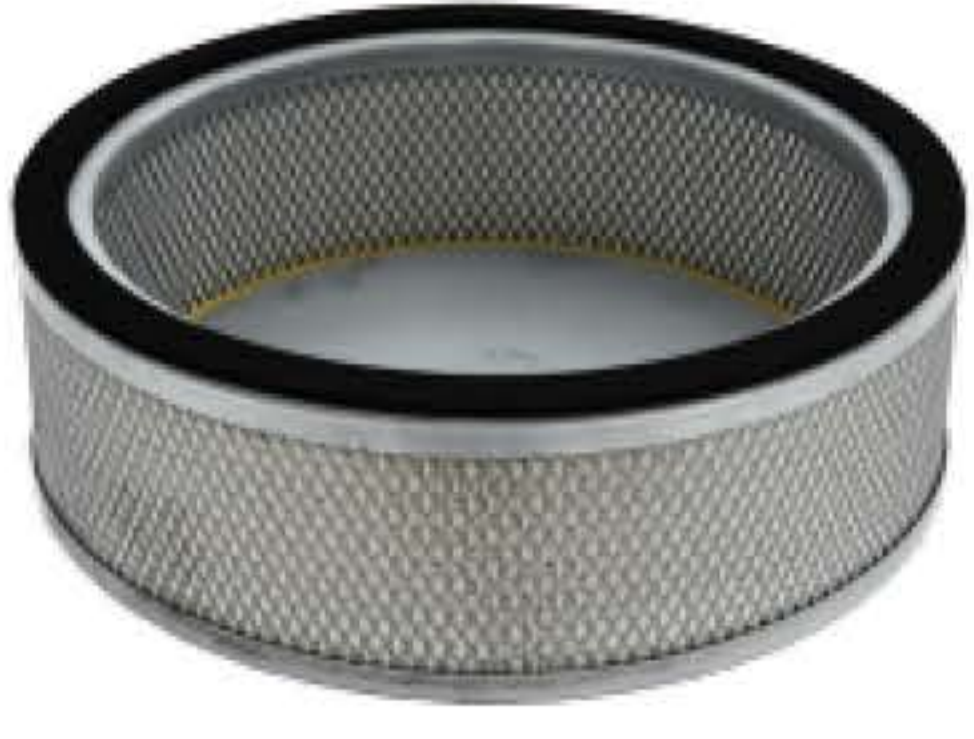
HEPA 14 Absolute filter (EN 1822) 28.000 cm 2 filter surface H14 Class Filter (EN 1822) Glass fiber