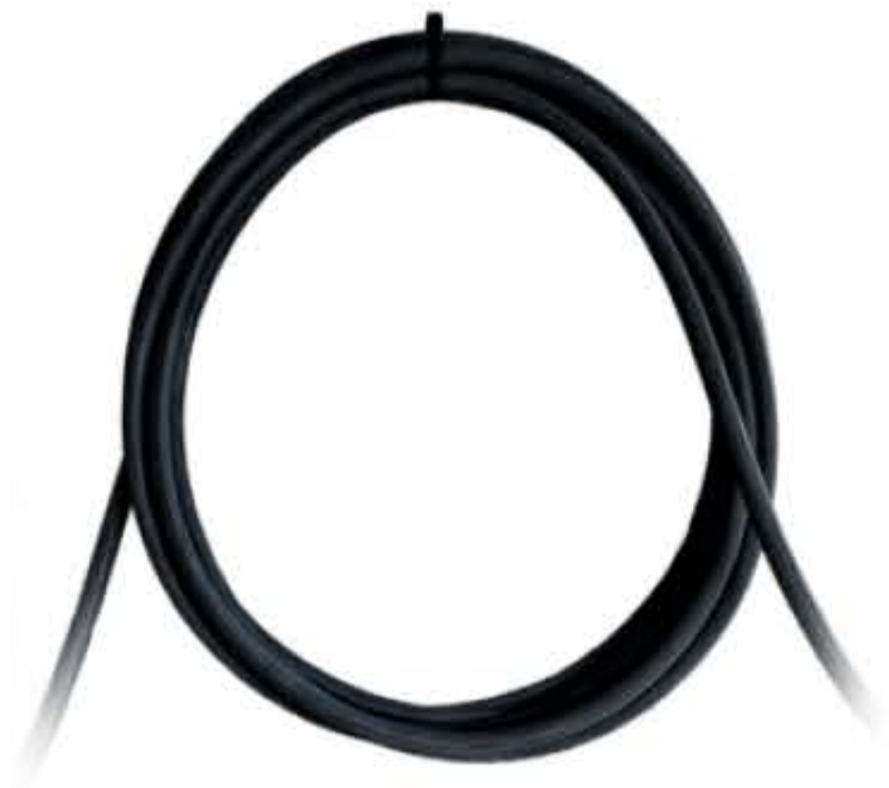
POWER SUPPLY CABLE