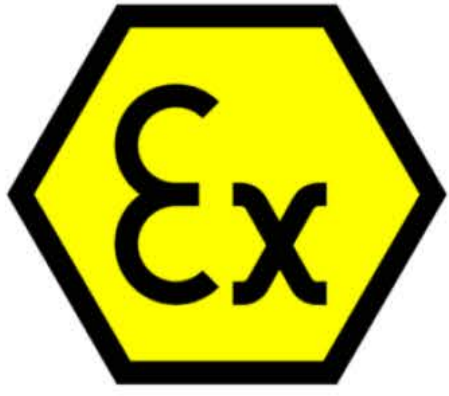
THIRD PARTY ATEX CERTIFICATION