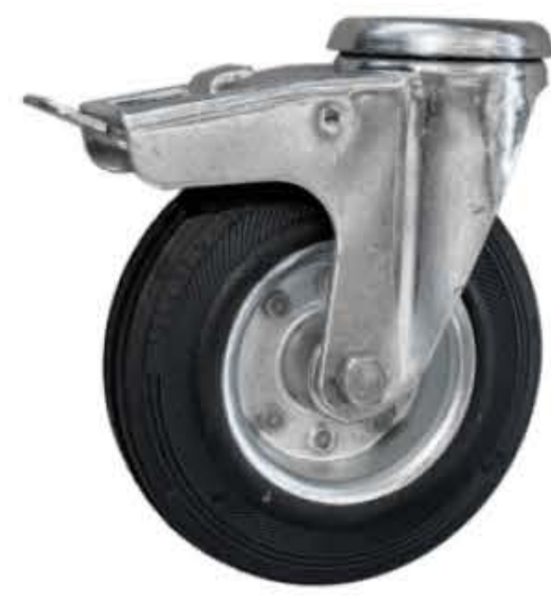
WHEEL WITH BRAKE Non-marking wheel with integrated brake