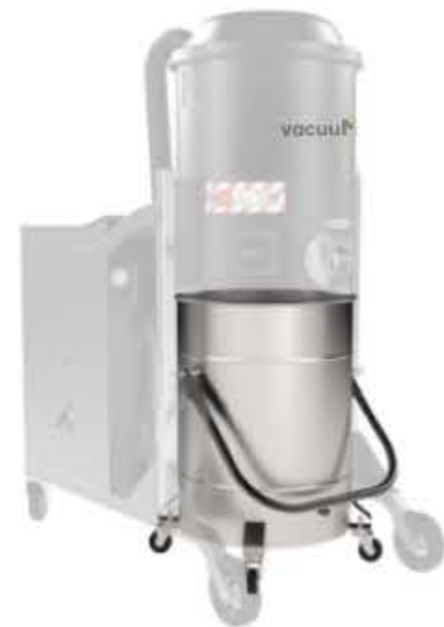
BX Stainless steel bin AISI 304