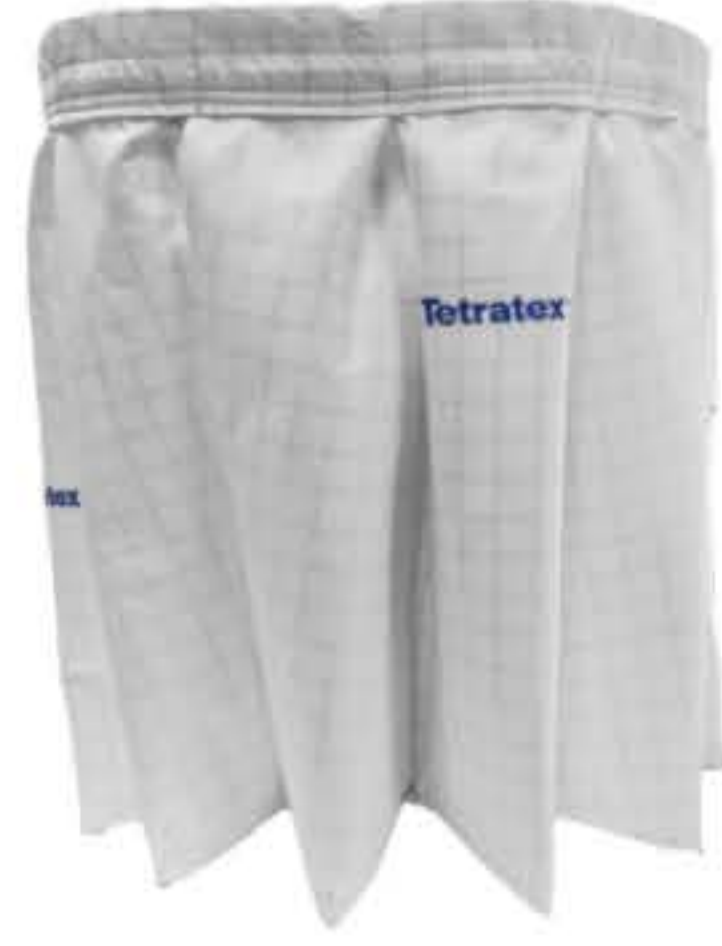
PTFE ANT Antistatic PTFE filter (M class EN 60335-2-69)