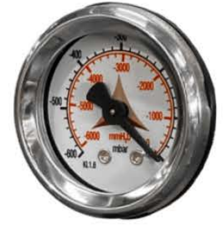
VACUUM GAUGE Vacuum gauge for indication of filter clogged or in need of replacement