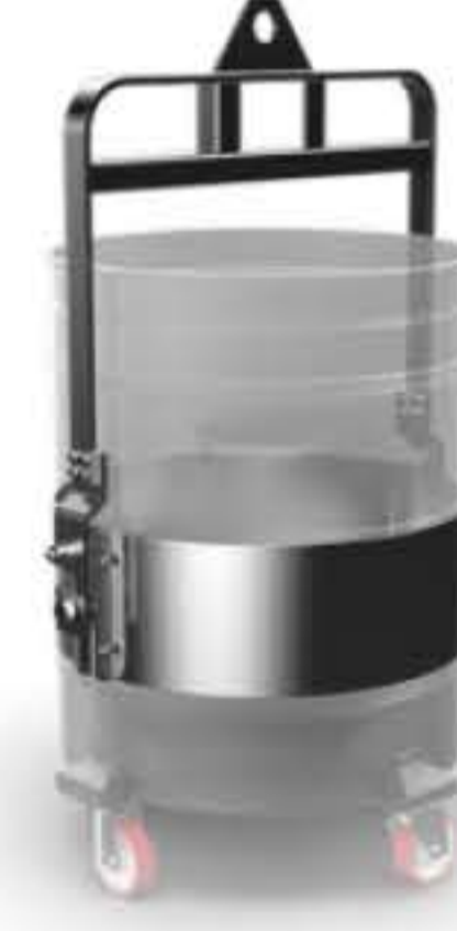
CONTAINER EMPTYING KIT System for easy container emptying using forklift lifting.