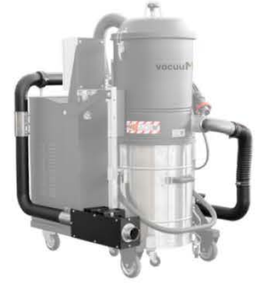
SPARK TRAP Built to capture sparks produced during welding, sanding, or polishing operations on metal parts