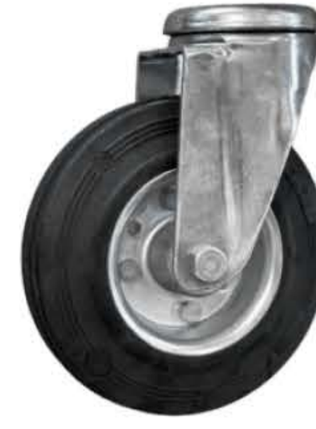
WHEELS Non-marking pivoting wheels