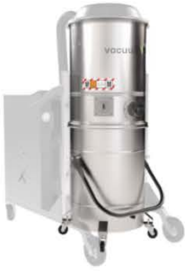
GX Stainless steel bin and chamber AISI 304