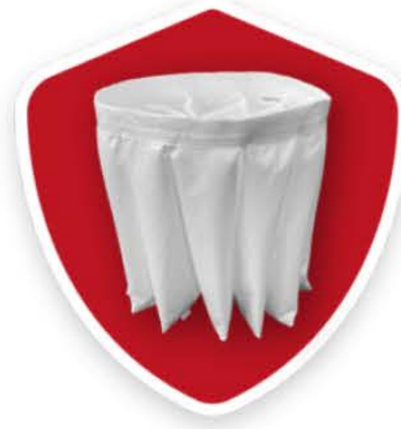
3 YEARS WARRANTY Purchasing the replacement filter along with the vacuum