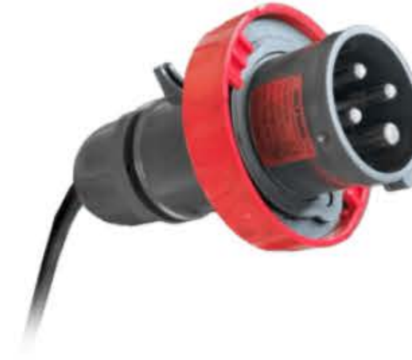
4-PIN ATEX INDUSTRIAL PLUG