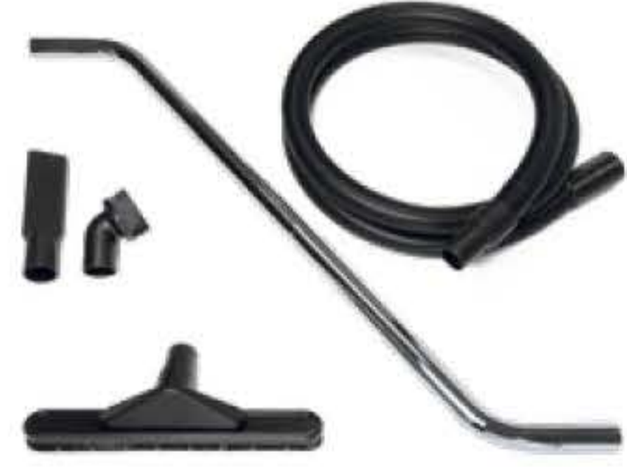
P13642 ANTISTATIC KIT PRO Ø 40MM Kit containing antistatic accessories for application with 40 mm diameter ATEX vacuum cleaner