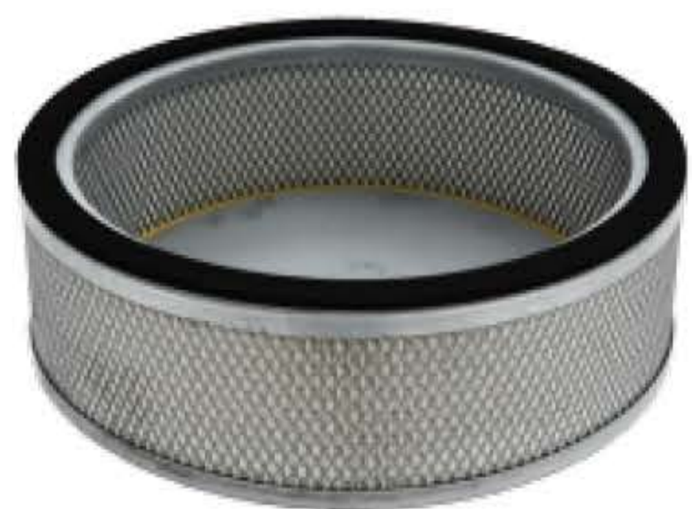
HEPA 14 Absolute filter (EN 1822)