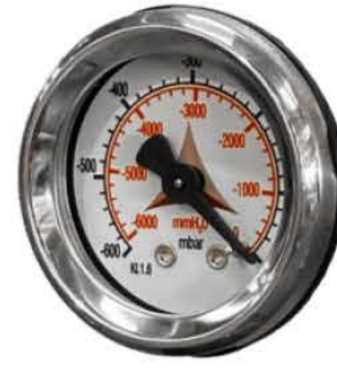
VACUUM GAUGE Vacuum gauge for indication of filter clogged or in need of replacement