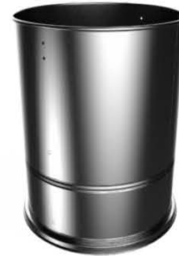
STEEL CONSTRUCTION Rugged industrial coated steel construction