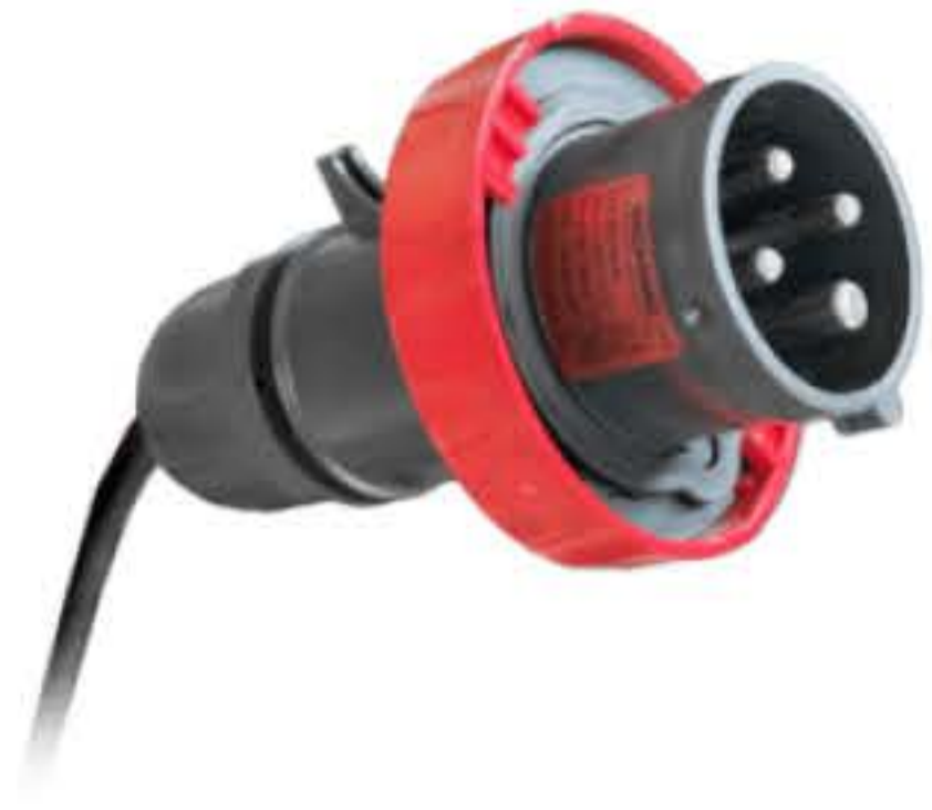
4-PIN ATEX INDUSTRIAL PLUG