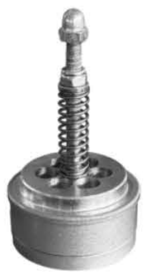
PRV Pressure relief valve installed