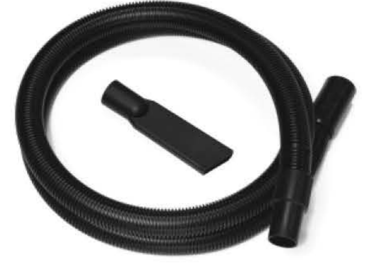
P13641 ANTISTATIC STARTER KIT Ø 40MM Basic kit containing antistatic accessories for application with 40 mm diameter ATEX vacuum cleaner