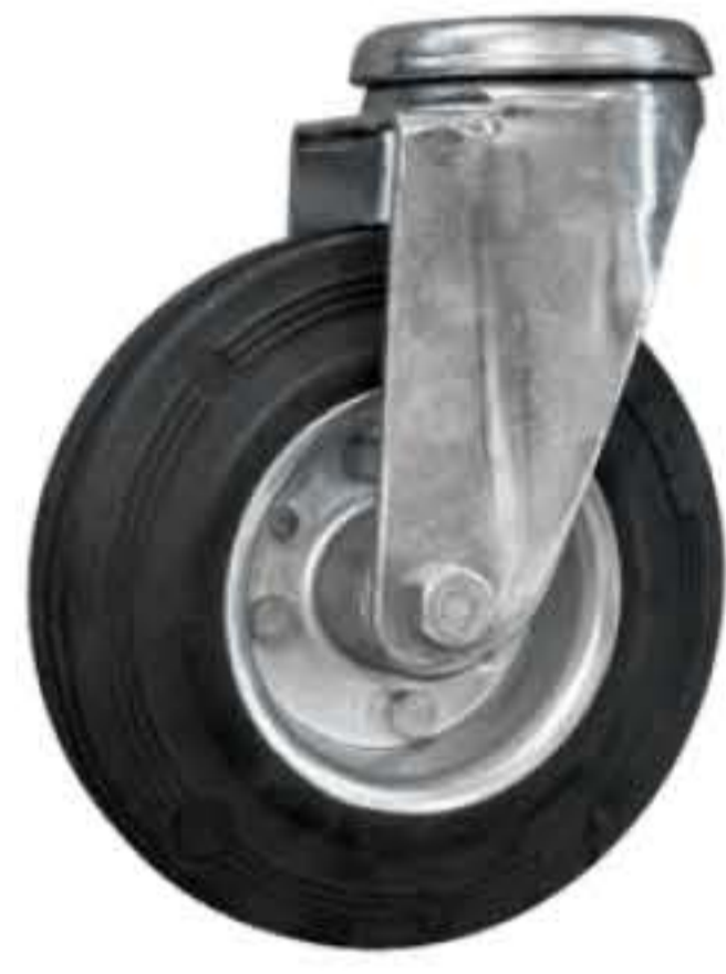
WHEELS Non-marking pivoting wheels