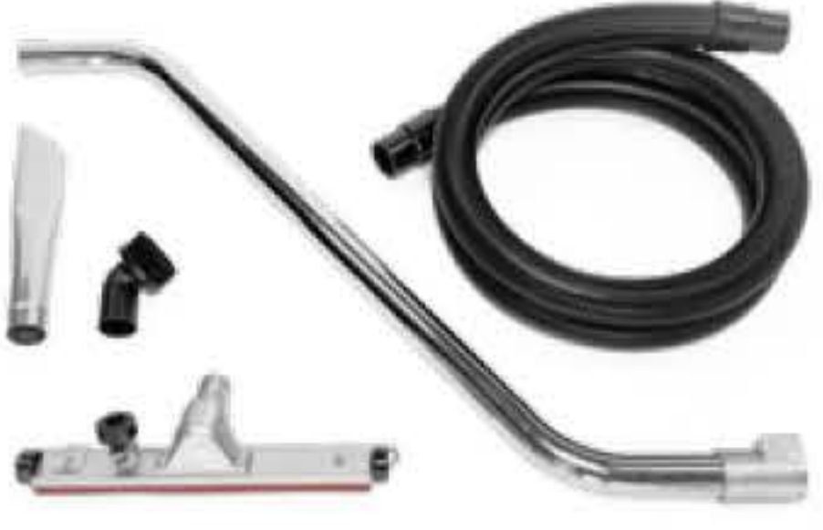
P12377 ANTISTATIC KIT PRO Ø 50MM Kit containing antistatic accessories for application with 50 mm diameter ATEX vacuum cleaner