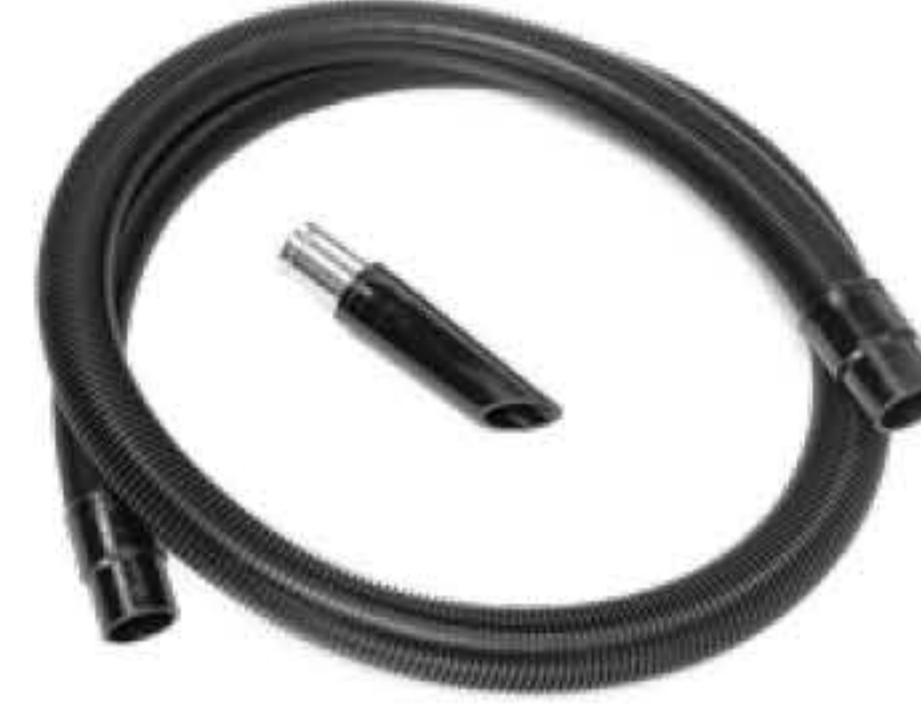
P12378 ANTISTATIC STARTER KIT Ø 50MM Basic kit containing antistatic accessories for application with 50 mm diameter ATEX vacuum cleaner