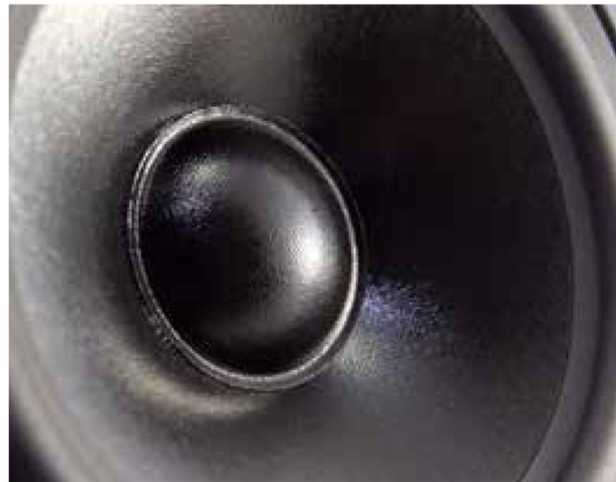
Bonding of dust cap with membrane