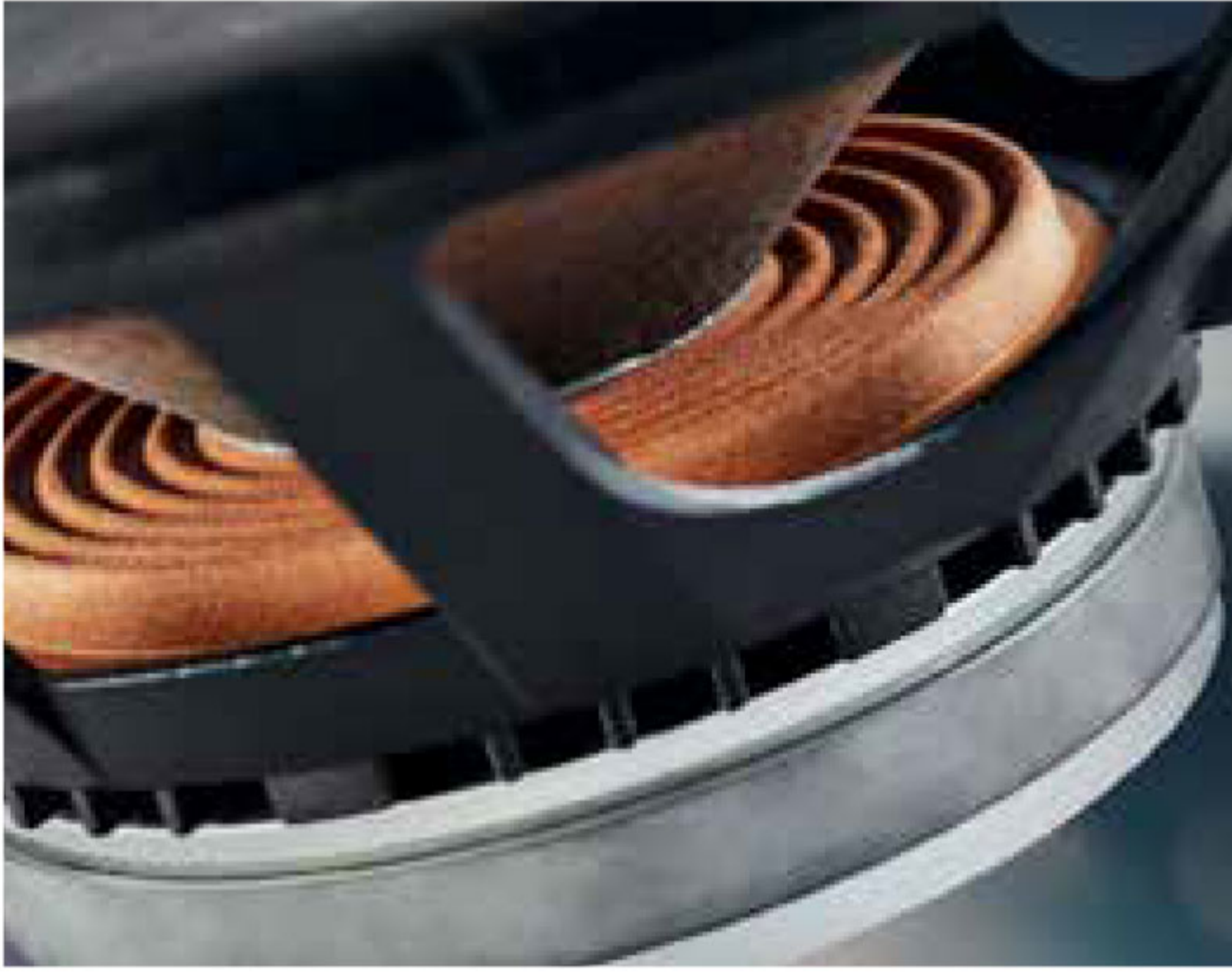
Bonding of pole plate, ferrite ring, front plate and basket