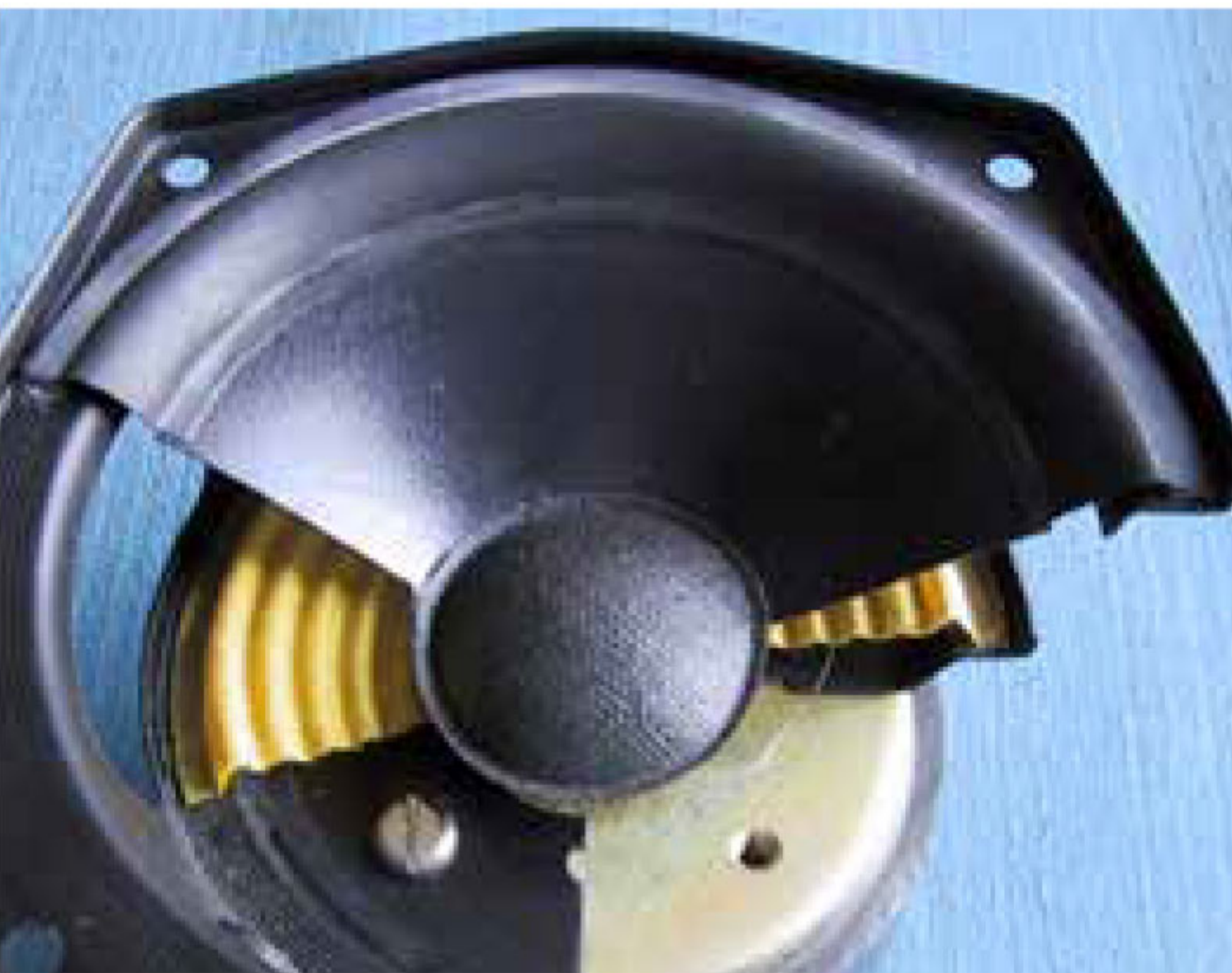
More bonding areas