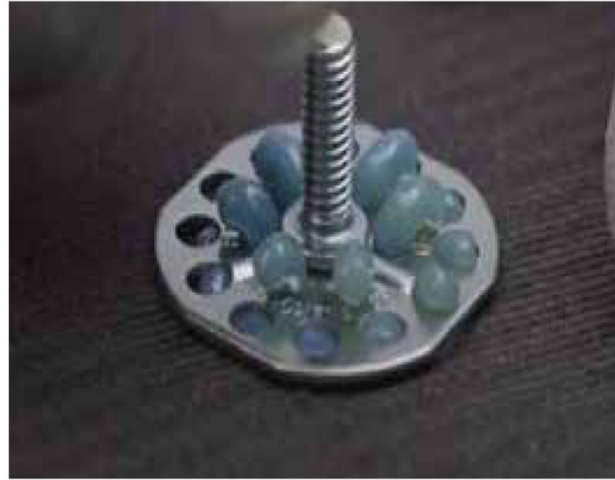
Composite & Metal