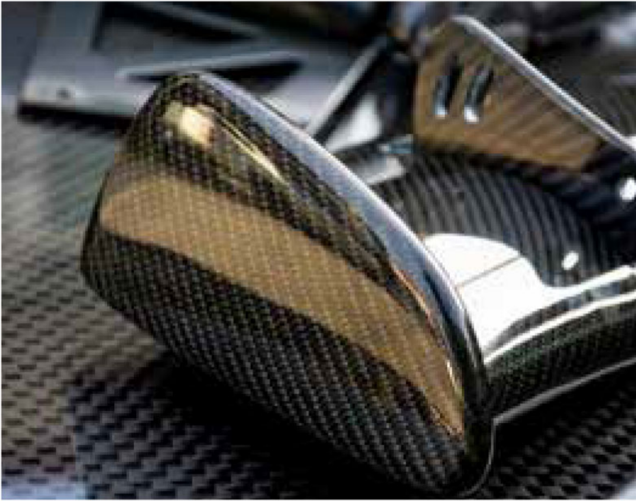
Composite & Composite