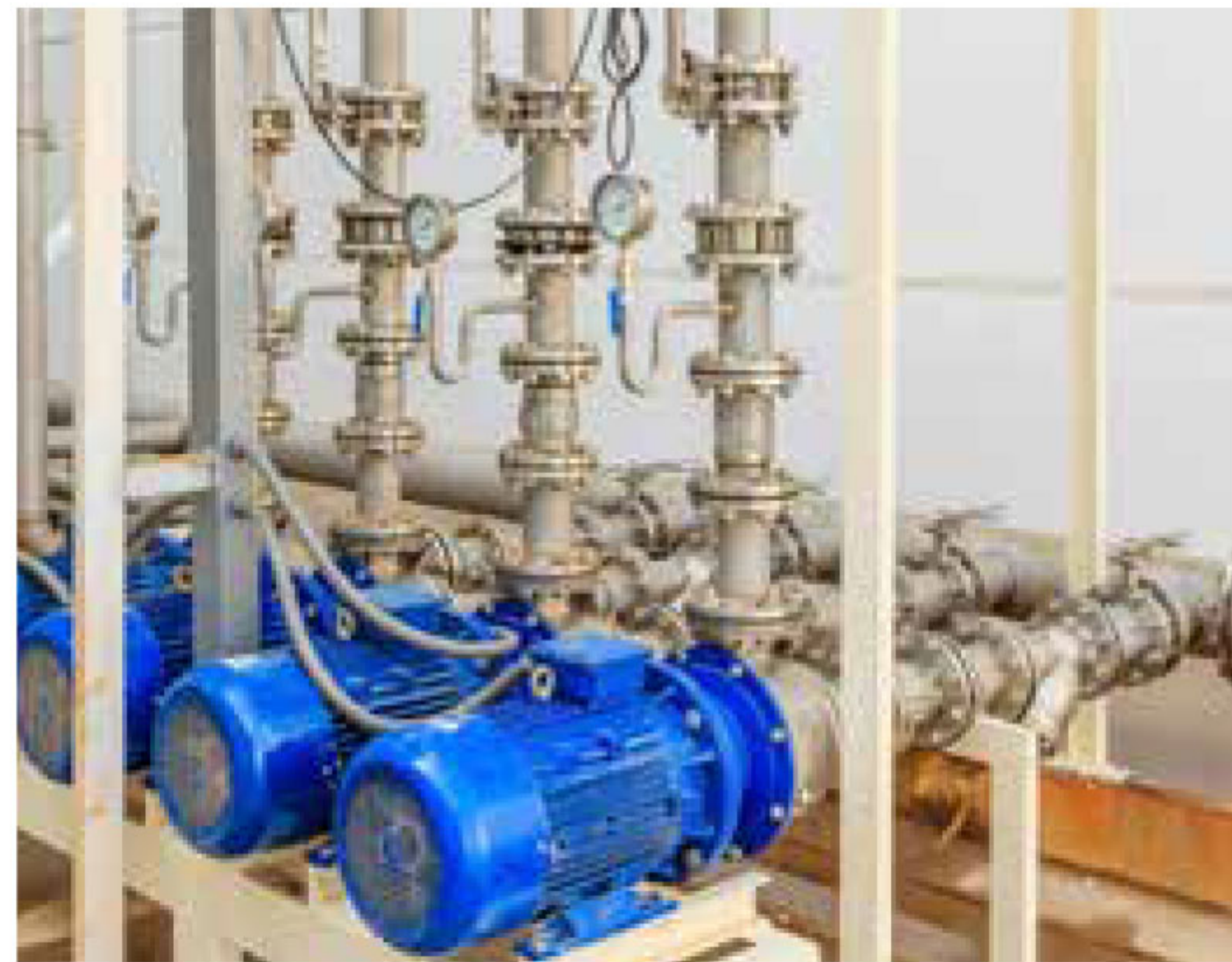
Sealing of flange connection