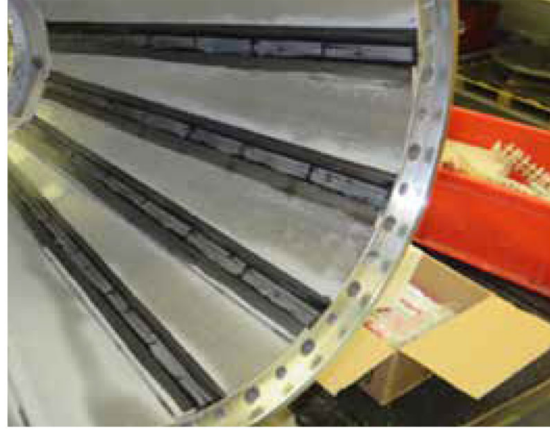
Structural bonding with media resistance