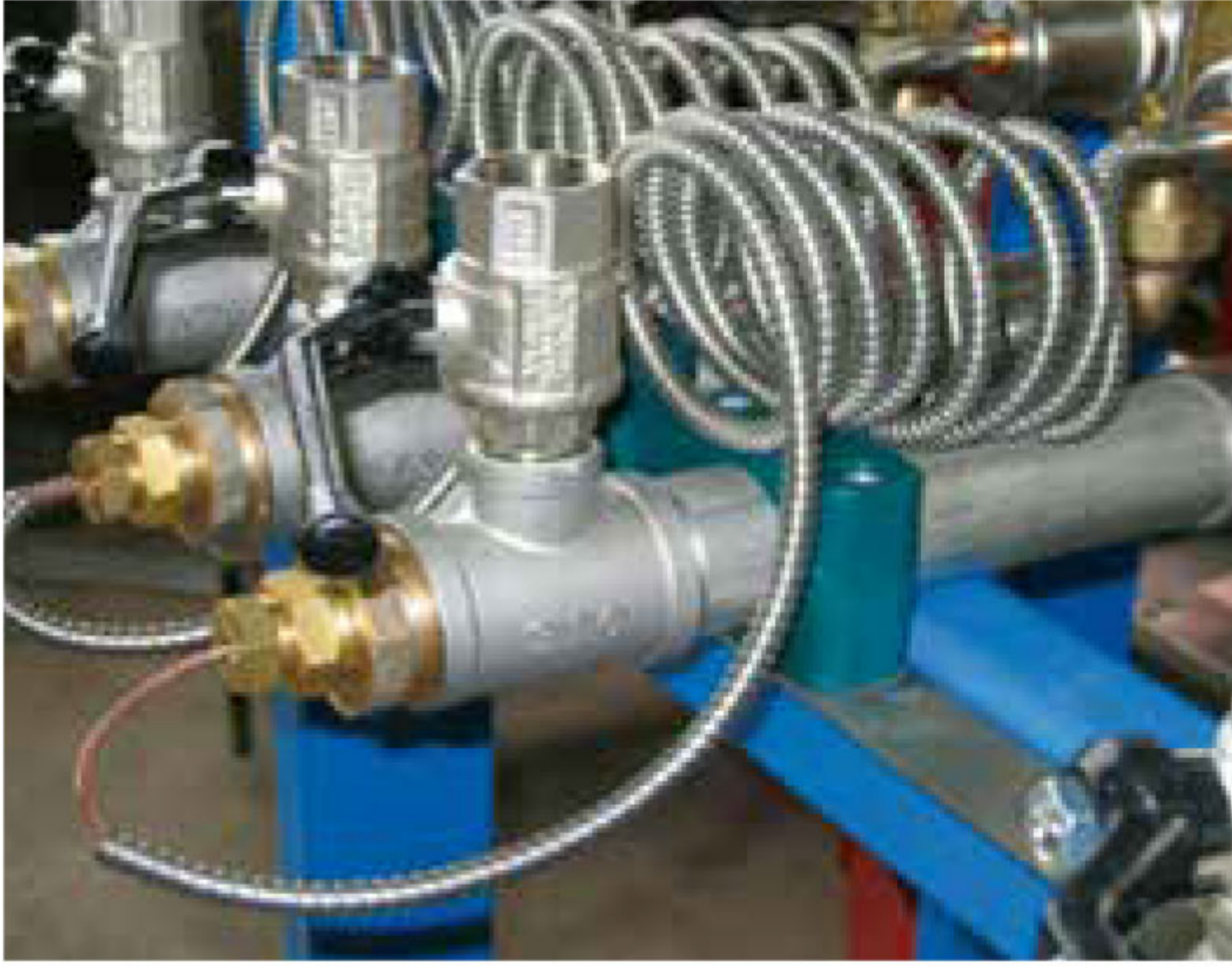
Bonding and sealing of pipe threads